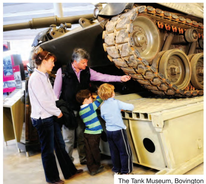
The Tank Museum, Bovington

"As part of an HR review, PLB planned an away day which gave staff the opportunity to provide feedback, and to be creative in suggesting the future direction of the business. It's these well thought through actions which encourage cohesion and demonstrate to the workforce that they are greatly valued."