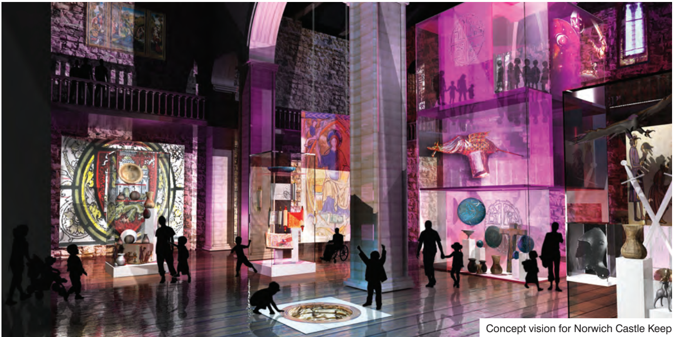
Concept vision for Norwich Castle Keep